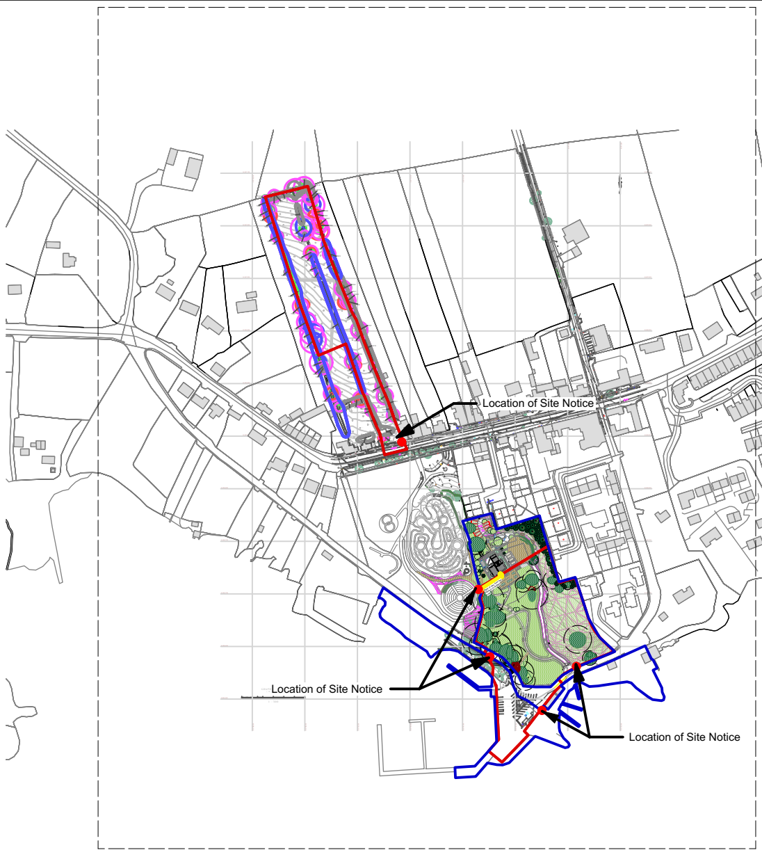
Please refer to INC2-S-003 for Mountshannon OS map